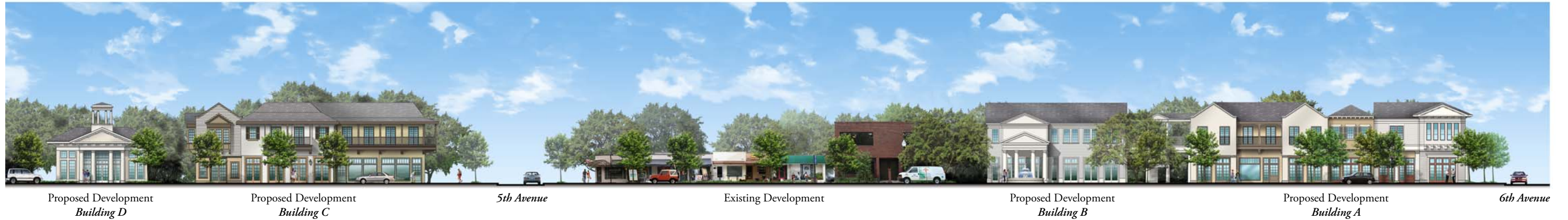
COMPOSITE OF ALL BUILDINGS (MAIN STREET FRONTAGE) Not to Scale